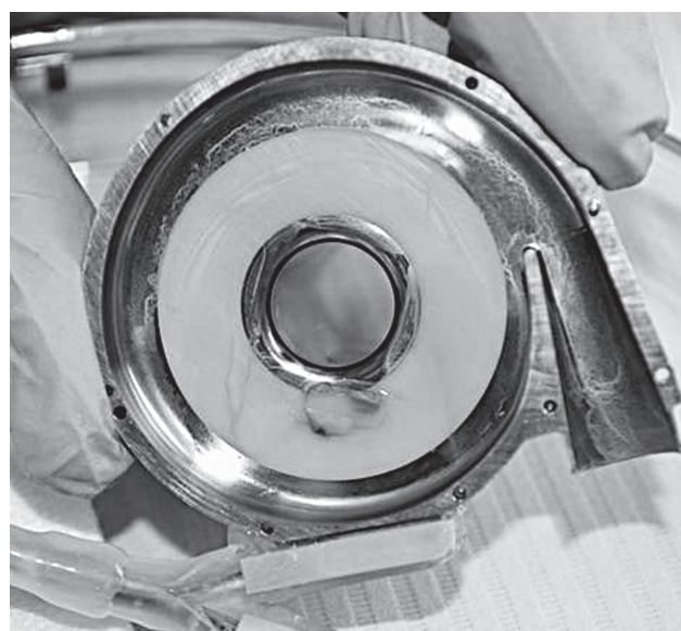
Fig. 2. A thrombus adhering to the hydraulic bearing was found on pump inspection